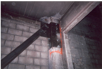
Seismic Retrofit Framing

DMBC STRUCTURAL ENGINEERS DM BERG CONSULTANTS, P.C. SERVING THE INDUSTRY SINCE 1963