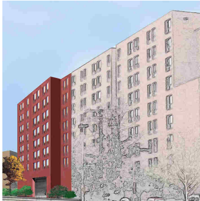
Addition shown in red.