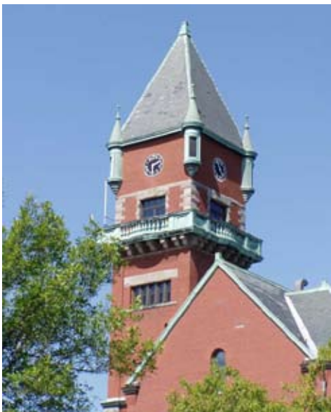
Leventhal-Sidman Clock Tower Restoration Newton, Massachusetts

An 11-story, 300+ unit elderly housing complex: Investigation and report on building envelope leakage through the masonry veneer and windows; produced complete Construction Documents (plans and specifications) for the demolition of the existing masonry veneer and windows and the replacement of the skin with an EIFS system and new windows; and provided complete Construction Administration services during construction.